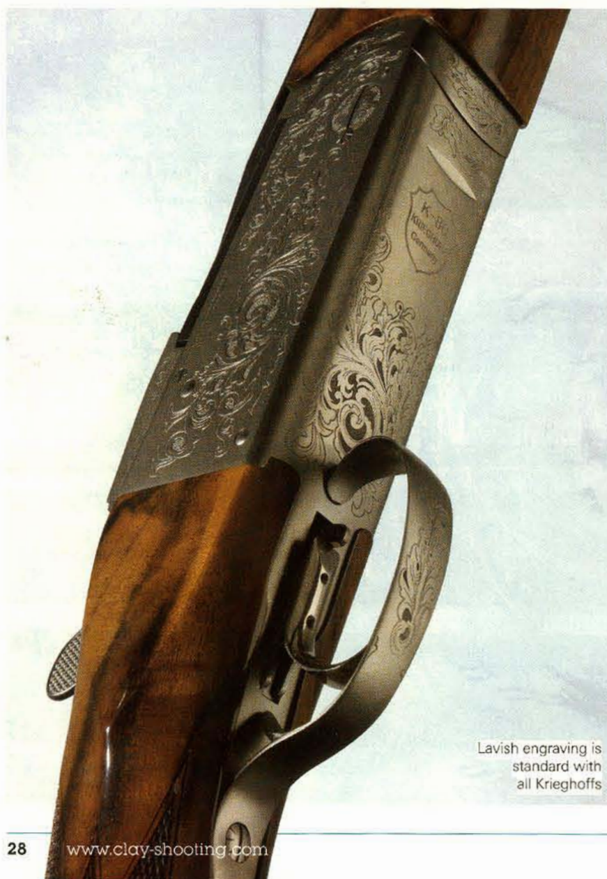
Lavish engraving is standard with all Krieghoffs