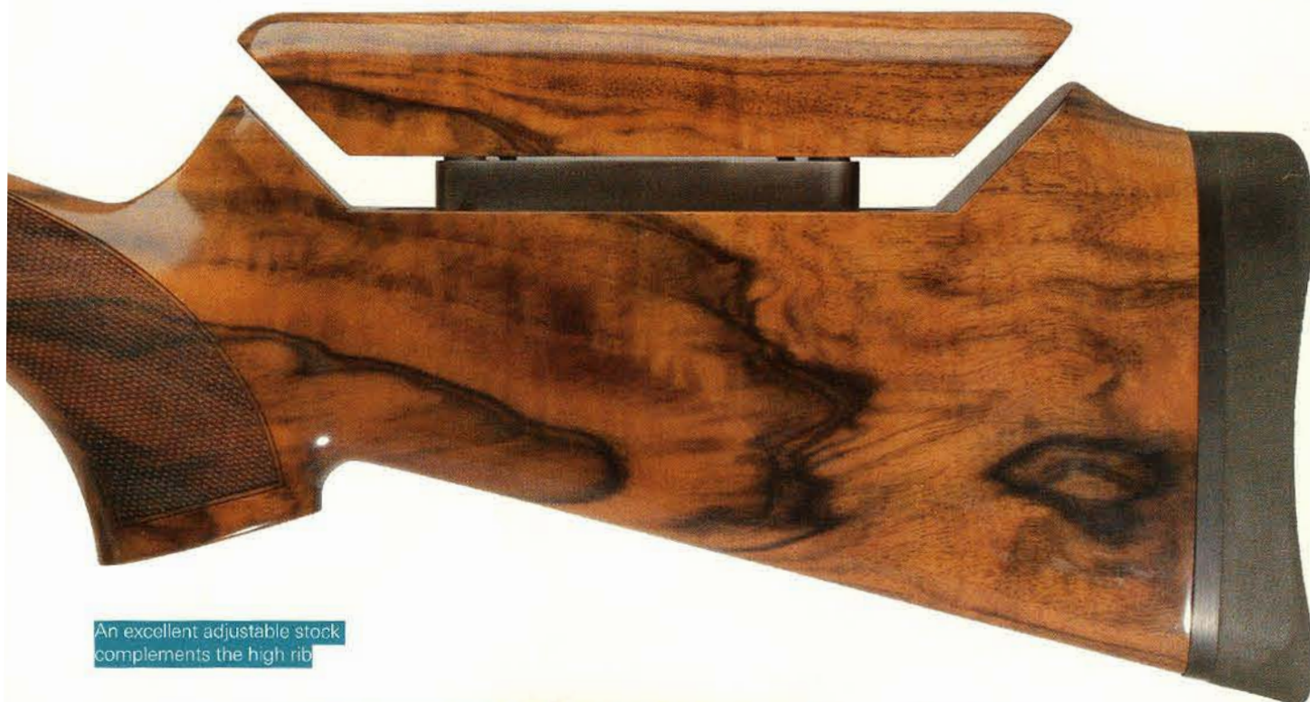
An excellent adjustable stock complements the high rib