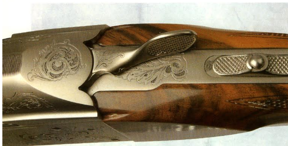
Impeccable wood to metal fit