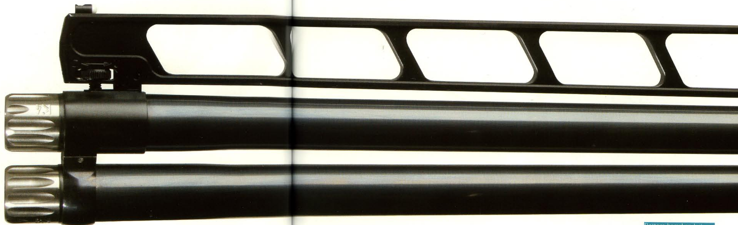
Bottom barrel and rib are adjustable for POI

The K80DTS (Double Trap Special) is a new Trap gun developed for Double Trap shooting. In prototype form German Double Trap shooter Andreas Loew took the Silver Medal in last year's World Championships and now it's in production, already with a history of success. An important feature of the DTS is its half rib which until now has been an after-market item. Like all high ribs it provides a head up position so that with the gun on the mark the shooter looks out a little further, duplicating the same kind of view you get by adopting a higher gun hold. The target comes into your peripheral vision, the only kind you can shoot with, sooner. The other benefit of the high rib is that it's less of a distraction than one that's just under your eye, and it's particularly useful when shooting doubles hence its almost universal popularity with Double Trap shooters. With the half rib Krieghoff also incorporates its free floating barrel assembly which, with three separate barrel hangers, gives a choice of three points of impact. The half rib can also be adjusted for POI with a small knurled wheel at the muzzle end.