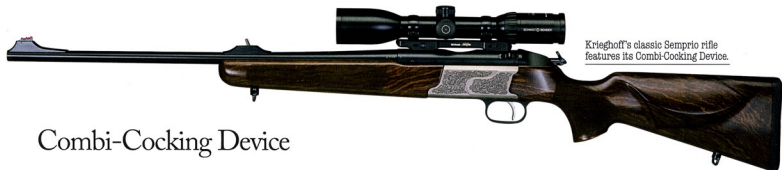
Krieghoff's classic Semprio rifle features its Combi-Cocking Device.