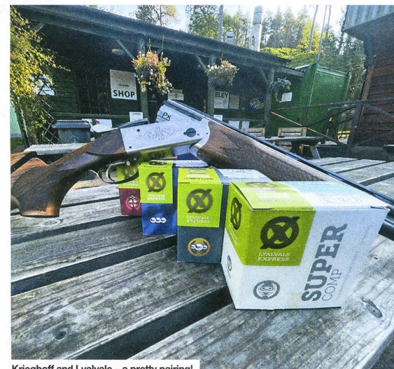
Krieghoff and Lyalvale – a pretty pairing!

Just remember: if you are in the market for a Krieghoff, I can't shout loud enough the importance of trying the different models out to find the one that suits you best, and how a bespoke stock makes all the difference. ■