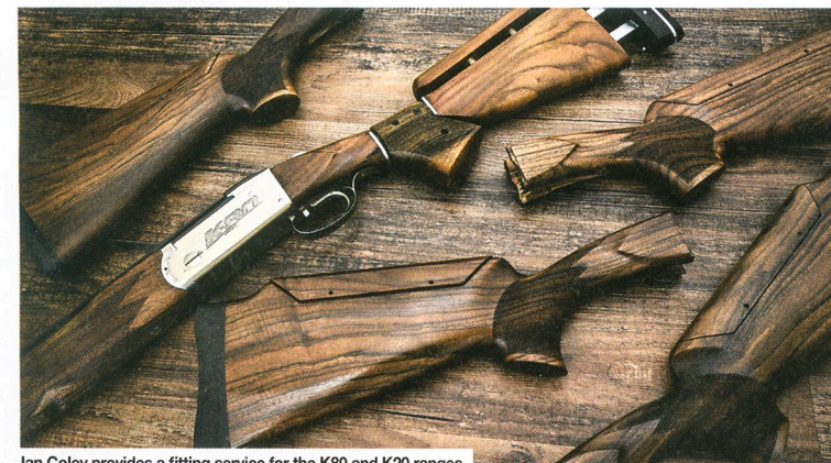
Ian Coley provides a fitting service for the K80 and K20 ranges