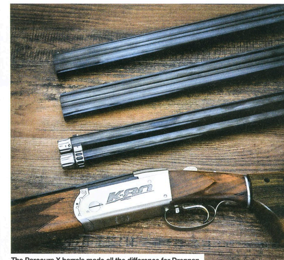
The Parours X barrels made all the difference for Drennan